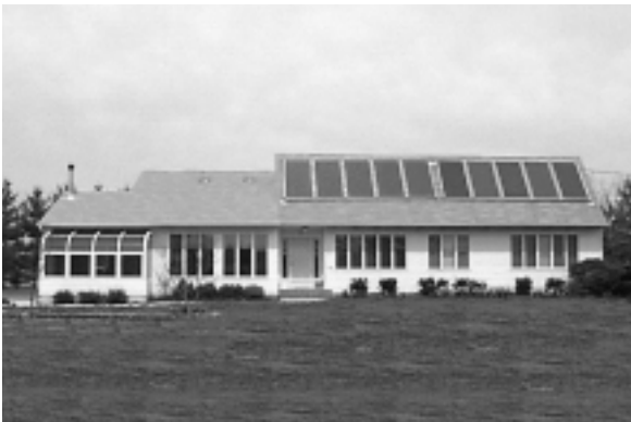
Ten flat-plate solar collectors heat water for this home in Elm, New Jersey; its many south-facing windows reduce heating bills in winter.

3. Title I Property Improvement Mortgage Insurance — Title I insurance enables lenders to make property improvement loans to creditworthy borrowers with little or no equity in their homes. For single family-homes, the maximum loan is $25,000. These second mortgages do not require energy efficiency calculations. Borrowers can piggyback Title I on Title II loans to help finance solar improvements that otherwise would not be eligible under the first mortgage.