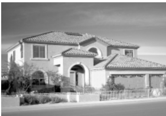
PIX05982/COURTESY OF SUN SYSTEMS