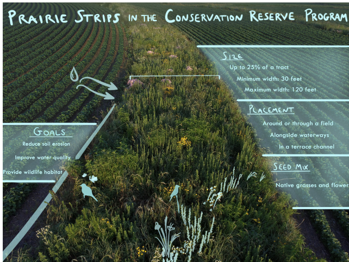
FIGURE 1. PRAIRIE STRIPS IN THE CONSERVATION RESERVE PROGRAM