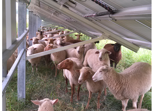
Sheep hanging out, using the solar array as a refuge from the heat on a hot day- Open View Farm

Anna and Ben Freund operate Open View Farm on land leased from Winooski based Crosspollination Inc. The farm is home to a 2.49 Megawatt DC solar array, which produces enough energy annually to power 350 to 400 homes. From the beginning, one of Crosspollination’s project goals was to incorporate sustainable energy with sustainable agriculture and have sheep graze within the solar array, mitigating the