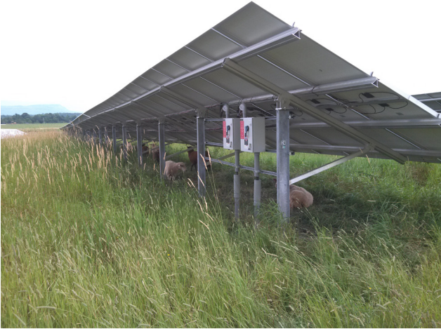
Forage and shade opportunities are good under Open View Farm's Solar Panels

sheep in the array during the hottest part of the summer and again in late fall. The panels provide a huge amount of shade, which the sheep appreciate and the array provides a stockpile of feed when other areas of the farm are being hayed. We also use the array as a secure place for the sheep to be on the rare occasions that we leave the farm to a sitter ”.