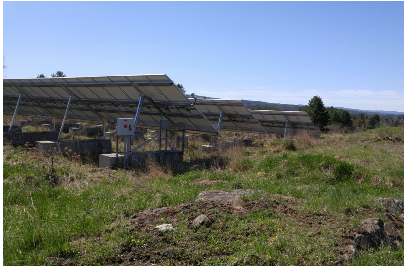
Solar array in the buffer zone at the McKnight Farm

The overlapping requirements of the solar property tax exemption and the current use program provide a twist – please review the details on page 2 of the Tax Department’s Technical Bulletin TB-69. It can be found here: http://tax.vermont.gov/research-and-reports/legal-library/technical-bulletins , and more general information on the current use program can be found here: http://tax.vermont.gov/property-owners/current-use , including removing your property from current use and paying the land-use-change tax.