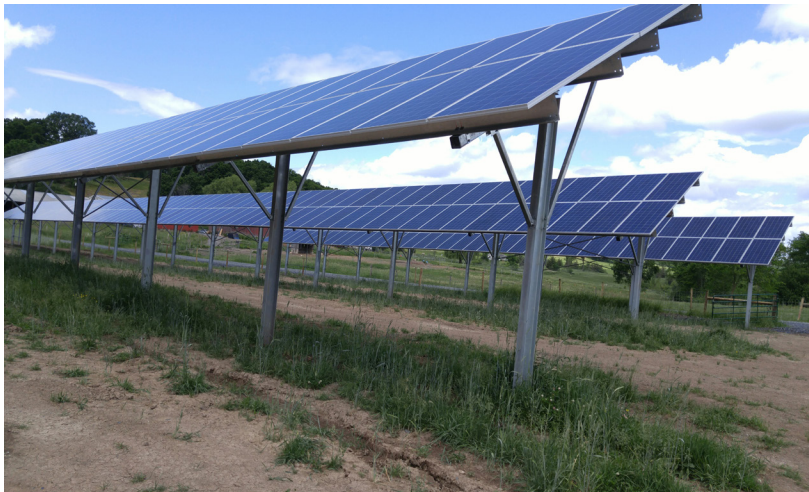
Still to be seeded down before cows come- Maple Ridge Meat

on, he will use the area for yearlings to graze. The animals are smaller, so that will help in handling them while learning how to manage cattle within the solar array.