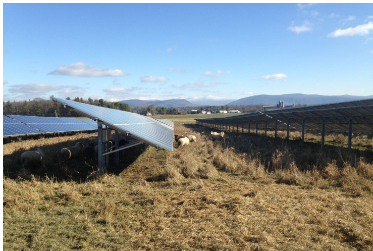
Sheep Grazing, Open View Farm

http://www.vtfarmtoplate.com/plan/chapter/4-6-food-system-energy-issues .