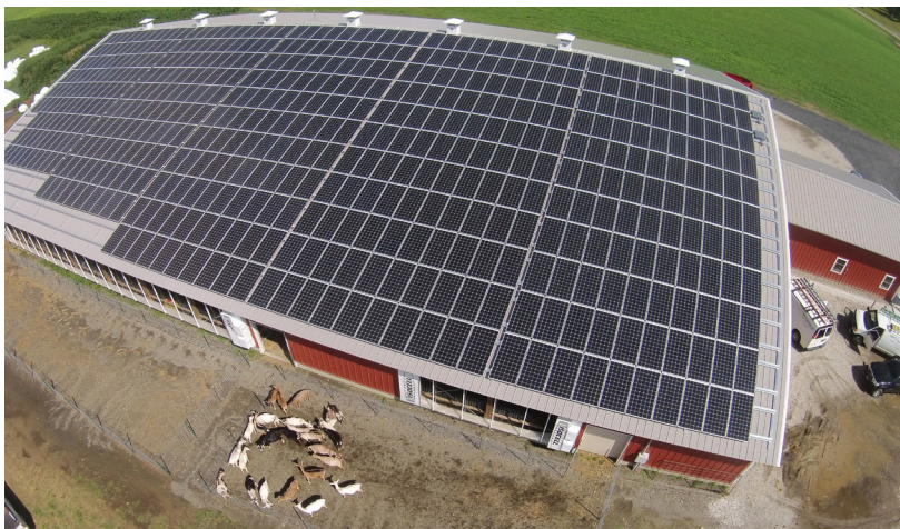
A 150kW system with 572 solar panels, utilizing a south facing roof on the Ayers Brook Goat Dairy in Randolph, VT.

Finally, as is illustrated in the case studies on the next few pages, farming-friendly solar is possible. In our examples, several