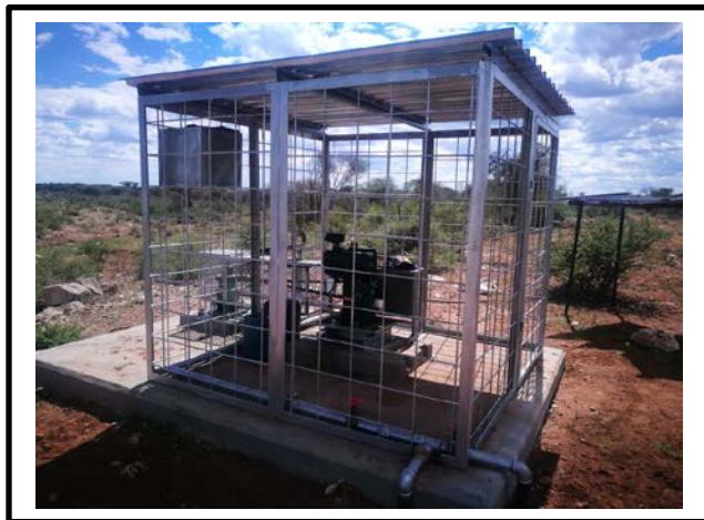
Figure 2: Water pump system.

Solar water pump technology converts sunlight into electricity to pump water. The PV panels use the medium of a motor that converts electrical energy generated by the PV panel into mechanical energy. The pump further converts it to hydraulic energy. There are three main variables that determine the pumping capacity of the system: pressure, flow, and power to the pump. To lift a certain amount of water up to the storage tank requires the pump to generate a certain level of pressure Chandel (2015). This is the work performed by a pump. The elevation difference between the water source and storage tank determines the work performed by a pump. For this reason, the PV array needs to supply certain power that the water pump will draw.