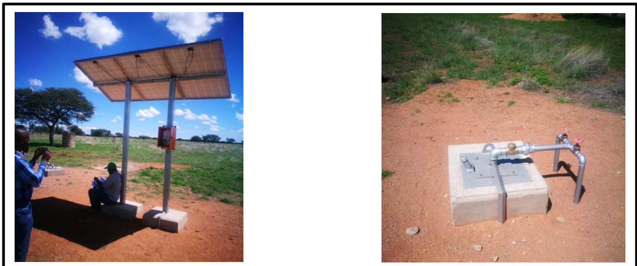
Figure 4: Setting up the system

Water analysis and soil tests conducted on the farm determined the feasibility of cultivating on the identified portion of the land. This physical testing also ascertained the appropriate location to construct the storage dams and install the system as well as to plot the proposed layout of the cultivated land. A portion of land was identified, cleared and prepared for soybean cultivation.