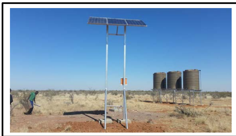
Figure 1: Selecting a tilt angle for the solar panels is important.

As was stated above, efficiency is a critical factor to consider in systems design. A reduction in overall performance of a system is a sign of lower efficiency. An effective method to improve efficiency is to adjust the tilt angle of the solar panel to allow it to reach an optimum level of power output and thereby increase the amount of water pumped daily. The availability of such a system establishes a more consistent supply of irrigation water and as such improves the quantity and quality of yield and overall productivity.