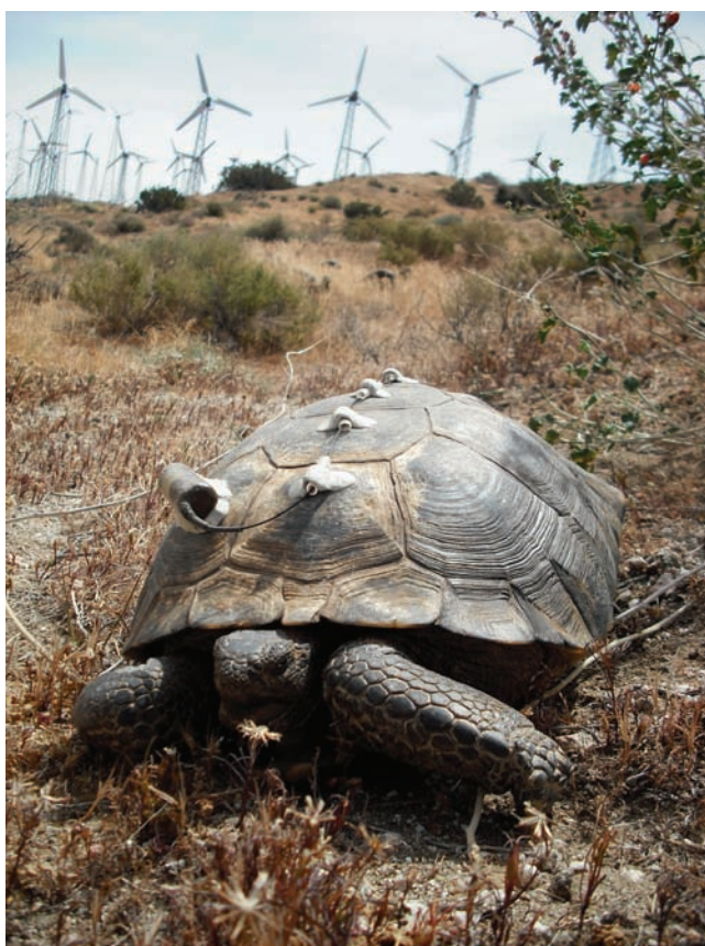
Figure 1. Agassiz's desert tortoise ( Gopherus agassizii ). Large areas of desert tortoise habitat are developed or being evaluated for renewable energy development, including for wind and solar energy.

tortoise ( Gopherus agassizii ; figure 1). Distributed north and west of the Colorado River, the species was listed as threatened under the US Endangered Species Act in 1990. Because of its protected status, Agassiz's desert tortoise acts as an "umbrella species," extending protection to other plants and animals within its range (Tracy and Brussard, 1994). The newly described Morafka's desert tortoise ( Gopherus morafkai ; Murphy et al. 2011) is another species of significant conservation concern in the desert Southwest, found east of the Colorado River. Both tortoises are important as ecological engineers who construct burrows that provide shelter to many other animal species, which allows them to escape the temperature extremes of the desert (Ernst and Lovich 2009). The importance of these tortoises is thus greatly disproportionate to their intrinsic value as species. By virtue of their protected status, Agassiz's desert tortoises have a significant impact on regulatory issues in the listed portion of their range, yet little is known about the effects of USSEDO on the species, even a quarter century after the recognition of that deficiency (Pearson 1986). Large areas of habitat occupied by Agassiz's desert tortoise in particular have potential for development of USSED (figure 2).