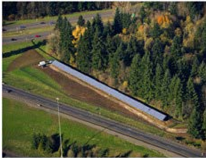
Oregon Solar Highway Demonstration Project