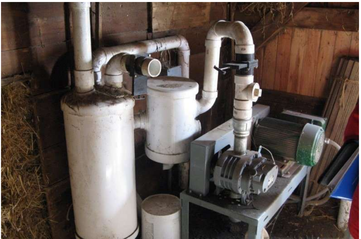
A dairy farm's vacuum pump is one of the best places to look for energy savings.

This is probably the most valuable single measure for a dairy farm, resulting in a reduction of vacuum pump energy use of as much as 60% and typical savings of thousands of dollars per year for a medium-sized farm. The Variable Speed Drive (VFD) - sometimes called a Variable Frequency Drive - is installed in the electrical line that leads to the pump, and varies the frequency of the electrical current reaching the pump's motor. This has the effect of reducing the speed of the motor when appropriate, as well as its energy use. Without the VFD, the pump will run at 100% output all the time during the milking cycle. Once the VFD is installed, the pump will run at the lowest possible output that is needed to give adequate vacuum for the milking system. In order for the VFD to work well, you must have the right type of vacuum pump (lobe pumps are ideal), but once it is installed, the VFD results in significant savings with no discernable change in system performance. Costs for VFDs have come down a great deal in recent years, and most farms would stand to benefit a great deal from installing one.