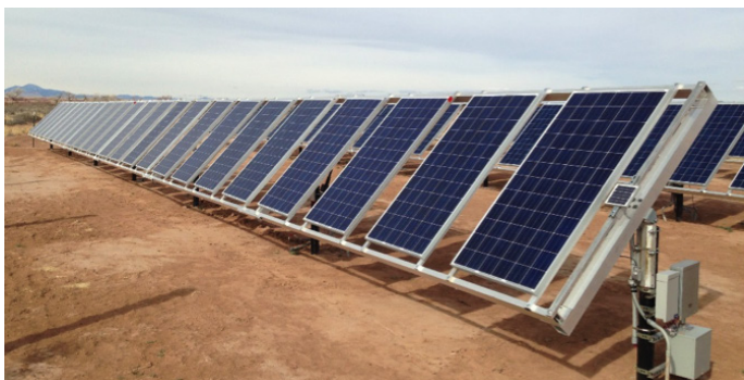
Figure 10. A ground-mount system with a north-south tracking capability to keep the array perpendicular to the sun. Array tilt can be set to latitude during spring and fall, and adjusted 15 degrees during the summer (latitude - 15 degrees) and the winter (latitude + 15 degrees).