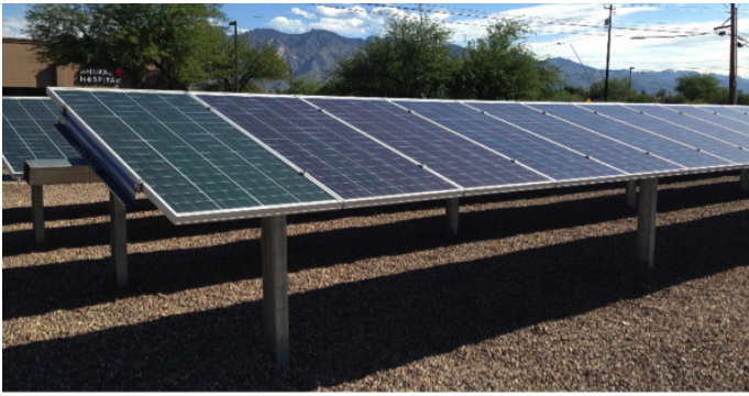
Figure 6. A ground-mount system requires space for installation. The size of the modules and array will impact the size and type of mounting system materials. Accessibility for maintenance, and air circulation for cooling modules are an advantage of this type of mounting system