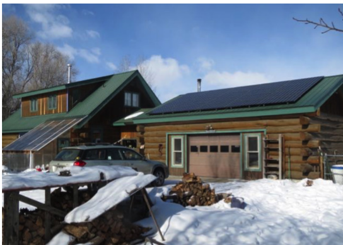
Figure 3. In a higher elevation, the array needs to be mounted so snow is not piling up on the edges of the modules.