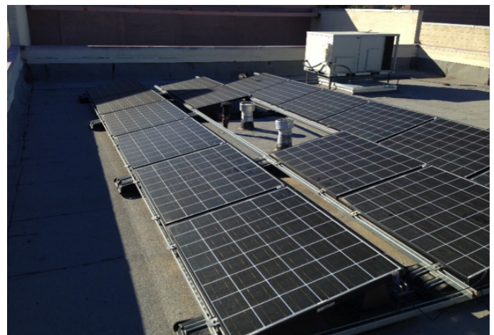
Figure 9. An array mounted on a flat roof of a commercial facility. Shade from a nearby wall is cast upon a portion of the array.