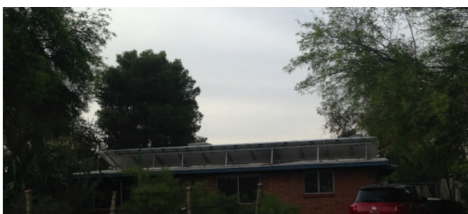
Figure 4. Tilt-up mounting systems on low slope or flat roofs are a method to set the tilt of the array to the latitude of the location to maximize the energy output of the array. Although this system is facing south, shading cast on modules from nearby trees can limit the amount of energy an array is capable of producing.

into consideration snow load and removal. Consulting with a roofing company to determine how a roofing material warranty might be affected is advisable.