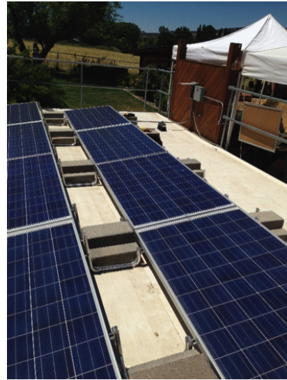
Figure 8. Ballast mounting systems rest on the surface of the roof and are held in place with cinder blocks. Modules are clamped to the aluminum frame at an angle of 10 degrees.

resulting in lower cell temperatures and higher performance (Hren, 2010). Ground-mount systems are safer to install because the work is done on the ground. There is no need for climbing or safety roping. This method provides easy access to the array for maintenance. The disadvantages to this method include: the amount of time needed for installation; the space required for the system; dealing with uneven ground or unstable soil-type, and keeping the surface area below and around the array free from growing brush. Accessibility to the system by humans and animals may need to be controlled to prevent damage to cables and access to system controls. Increased theft, or vandalism may be an issue and require a security fence or enclosure. In high elevations where snow is an issue, the system needs to be designed to allow for easy snow removal. A system consisting of multiple rows of modules needs to be spaced so shadowing from one row does not interfere with the next row behind it. A decision on the maintenance of the ground area below and around the ground-mount array needs to take into account the time and expense for weed and brush control. A ground cover such as gravel can be used for drainage, minimize erosion, and can eliminate (or reduce) the need for vegetation control, but is an added expense.