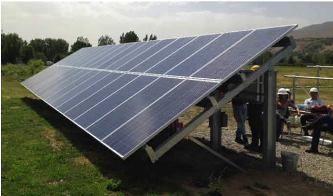
Figure 7. Solar modules arranged in two rows on a large fixed-plate ground mount system. The larger size modules require larger mounting materials to support the weight and to keep the system stable during high wind winds and at a tilt angle to allow snow loads to be easily removed.

resulting in lower cell temperatures and higher performance (Hren, 2010). Ground-mount systems are safer to install because the work is done on the ground. There is no need for climbing or safety roping. This method provides easy access to the array for maintenance. The disadvantages to this method include: the amount of time needed for installation; the space required for the system; dealing with uneven ground or unstable soil-type, and keeping the surface area below and around the array free from growing brush. Accessibility to the system by humans and animals may need to be controlled to prevent damage to cables and access to system controls. Increased theft, or vandalism may be an issue and require a security fence or enclosure. In high elevations where snow is an issue, the system needs to be designed to allow for easy snow removal. A system consisting of multiple rows of modules needs to be spaced so shadowing from one row does not interfere with the next row behind it. A decision on the maintenance of the ground area below and around the ground-mount array needs to take into account the time and expense for weed and brush control. A ground cover such as gravel can be used for drainage, minimize erosion, and can eliminate (or reduce) the need for vegetation control, but is an added expense.