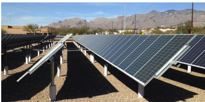
Figure 11. An east-west tracking commercial-sized array. A hydraulic ram pulls and pushes a rod connecting multiple rows of arrays. The array position begins facing the east in the early morning. The array moves a slight bit every 15 minutes to follow the sun as it crosses the sky. At sun down, the array is repositioned to face the east.