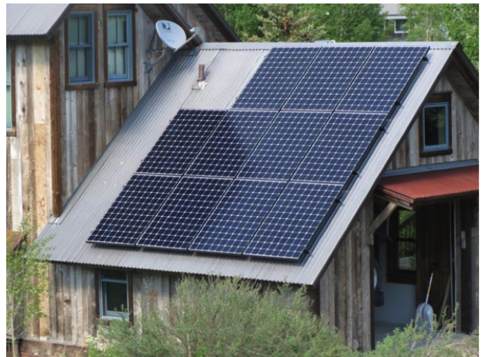
Figure 1. A roof mount array on a pitched roof. There is open roof space on all sides of the array for access. The empty space is next to the roof vent.

The rails and mounts for supporting solar modules are made of aluminum. Attaching the system involves penetrating the roofing material and securing the system feet to the roof using lag bolts and sinking into the rafters. Care must be taken to seal the penetration to prevent moisture from invading the roof and resulting in possible long-term damage. Appropriate flashing materials are recommended for roof-mount systems. In locations with steep roofs and snow, system design must take