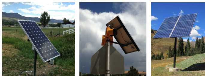
Figure 5. Modules or array affixed to a rack and mounted on the top of or to the side of a pole. The pole-mount can be oriented in a specific direction. The amount of excavation depends on the size of the array.

System installation design of the roof-mount system must adhere to local fire codes. This includes a recommended set back of the array from all edges of the roof to allow access by