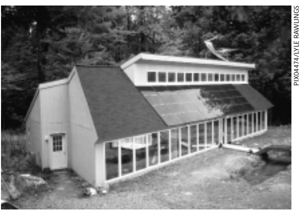
This home in Hopewell, New Jersey, demonstrates the effectiveness of off-grid photovoltaics, solar thermal water heating systems, and passive solar building design.

The Rural Business-Cooperative Service offers a "Rural Economic Development Loan Program" that provides zero-interest loans to RUS borrowers to promote rural economic development and create jobs. The maximum loan amount depends on the amount of funds available each fiscal year. Recently, the average loan has been $300,000. The Rural Economic Development Grant Program provides grants to RUS borrowers to promote economic development. Grants are used to establish revolving loan funds to provide infrastructure or community facilities in rural areas that will lead to economic stability.