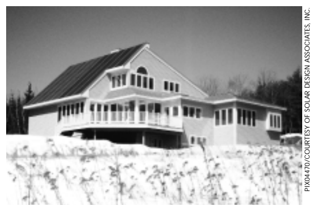
A house on the coast of Maine beautifully integrates a utility-grid-tied photovoltaic power system into the roof.

Eligibility Criteria—Eligibility requirements for a 7(a) loan are as broad as possible so the program can accommodate a variety of small business financing needs. Eligibility factors include the size and type of business, use of the proceeds, and the availability of funds from other sources.