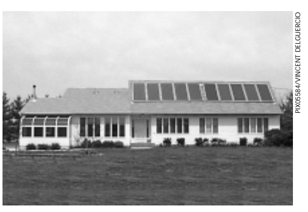
Ten flat-plate solar collectors heat water for this home in Elm, New Jersey; its many south-facing windows reduce heating bills in winter.