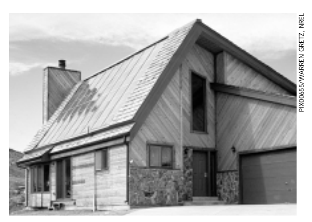
An example of a solar thermal system: The collectors for a flat-plate, solar thermal water heating system have been installed on the roof of this house in Golden, Colorado.

Solar thermal energy systems heat indoor air or water, and they are also used for air-conditioning. Solar collectors trap the sun's rays to produce heat. Most collectors are built in the shape of a box, frame, or wall, and some are a whole room. Most contain these parts: (1) clear covers that let in solar energy; (2) dark interior surfaces (absorbers) that soak up heat; (3) insulation materials that prevent heat from escaping; and (4) vents or pipes that carry heated air or liquid from inside the collector to the place where it is used.