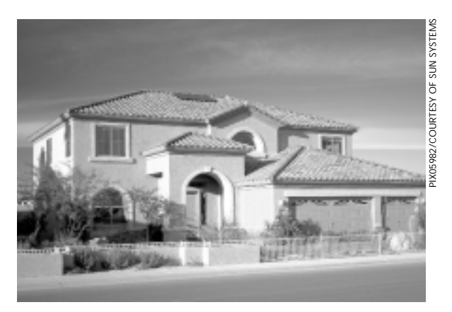
Solar thermal water heating systems can be attractively integrated into a home's exterior design.

RUS also administers two electric loan programs: the Guaranteed Program and the Direct Loan Program. The Guaranteed Program is used primarily by power supply cooperatives or borrowers and is a 100% loan-guarantee program. The interest rate is based on the Treasury yield curve (20-30 years). There is $300 million available in this program. The Direct Loan Program is based on appropriations from Congress. The interest rate is based on the municipal bond rate for AA utilities. Photovoltaics is an eligible technology (including grid-independent systems) for RUS loan programs. The 60 electricity generation & transmission companies and 800 cooperatives are eligible for this loan program; RUS applies only to existing rural electric cooperatives.