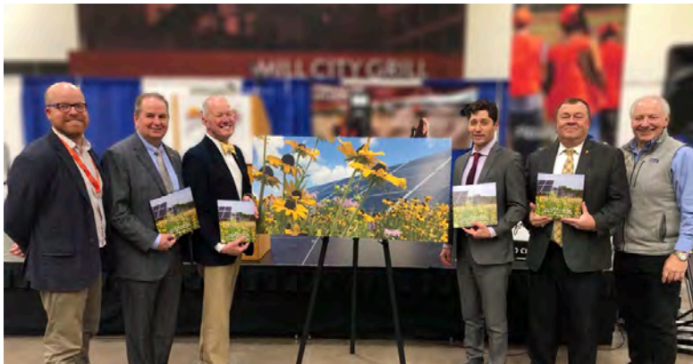
Xcel Energy, Connexus Energy, SMMPA, & City of Minneapolis recognized for pollinator friendly Solar procurement commitments at Pheasant Fest, nation's largest gathering of pheasant hunters and conservationists.

Additionally, by asking for PV solar projects that provide co-benefits in addition to carbon-free electricity, corporations and electric utilities can generate goodwill among agricultural, conservation, and environmental stakeholders even before projects are selected. This reduces time, risk, and total project costs for all parties.