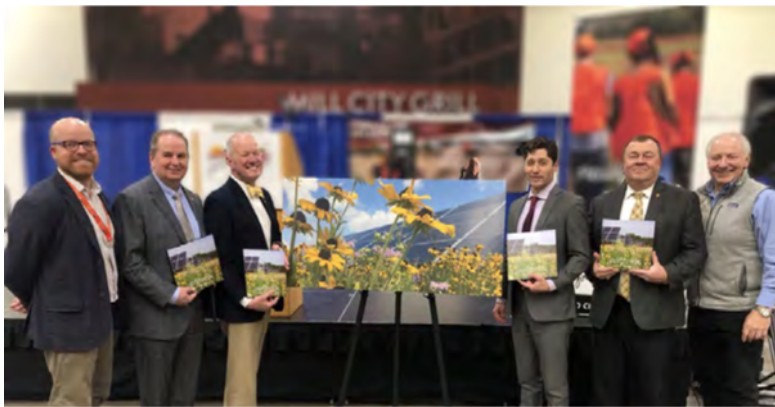
Xcel Energy, Connexus Energy, SMMPA, & City of Minneapolis recognized for pollinator friendly Solar procurement commitments at Pheasant Fest, nation's largest gathering of pheasant hunters and conservationists.

Additionally, by asking for PV solar projects that provide co-benefits in addition to carbon-free electricity, corporations and electric utilities can generate goodwill among agricultural, conservation, and environmental stakeholders even before projects are selected. This reduces time, risk, and total project costs for all parties.